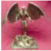
A miniature version of a four meter high statue to be erected in Brazil hails this prince as "Savior of the World."

THE ANTICHRIST AND A CUP OF TEA presents the fascinating saga of the British Monarchy's centuries-long endeavor to establish a "New World Order," and gives hard evidence to suggest the identity of the AntiChrist.